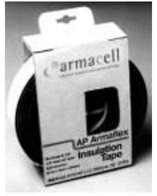
AP Armaflex Insulation Tape is available in standard cartons and tape dispensers.

release paper as the tape is spirally wrapped around the piping or fittings and pressed firmly in place. Avoid stretching the tape as it is being wrapped. Pressure-sensitive adhesive adheres firmly and forms a long-lasting bond with metal surfaces. On cold piping, the number of wraps